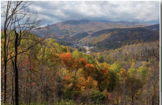
View of downtown Gatlinburg from top of property.