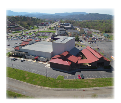
Opry Theater Stables

The theater is configured to seat 1351 people and is is fully equipped to stage a major Broadwaystyle musical production.