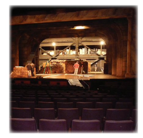
Theater Stage Pre-Performance