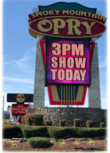
Opry Theater Sign