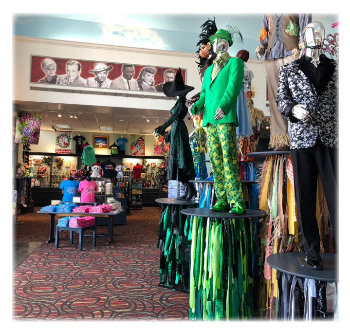
Theater Gift Shop