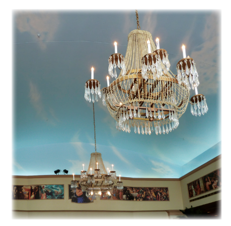
Theater Lobby Ceiling